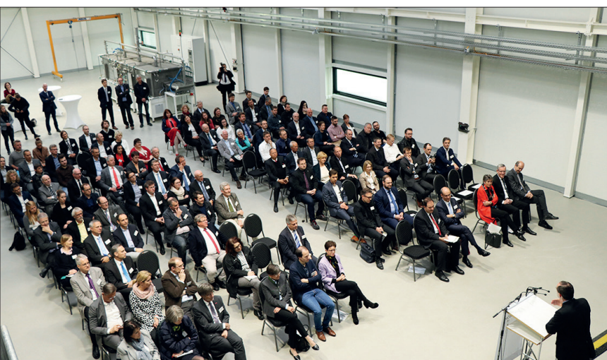
Fig. 1 Guests at the inauguration ceremony

At the Fraunhofer Center for High-Temperature Materials and Design HTL in Bayreuth/DE, the new building for a fibre pilot plant, unique in Europe, was inaugurated on 12 April 2019. A total of EUR 20 million (including EUR 11 million for the production lines) were invested in the facility with a useful area of 2000 m 2 . Speaking in front of numerous guests from politics, commerce and industry, Hubert Aiwanger, Bavaria's Minister of Economic Affairs, Andreas Meuer, Director at the Fraunhofer Gesellschaft, Brigitte Merk-Erbe, Mayor of the city of Bayreuth, Dr Markus Zanner, Chancellor of Bayreuth University, acknowledged in their welcoming addresses the major significance of the construction project for the regional ceramics and textiles industry as well as the supply of European companies with these high-quality materials. Director of the Fraunhofer Center HTL, Dr Friedrich Raether (FR), explained to us the technical and economic background to this forward-looking project.