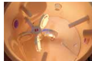
Thermo-optical measuring system TOM_wave