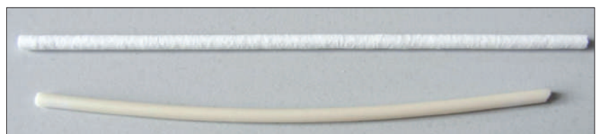
Fig. 6 Solid rods (diameter 3,3 mm) made out of RAMUL-HT (top) and a benchmark material (bottom) after five kiln cycles at a dwell temperature of 1600 °C