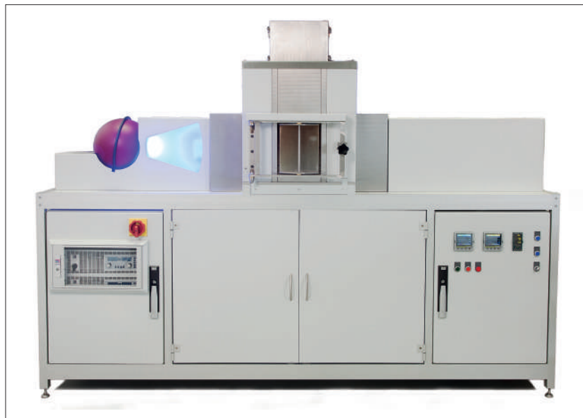
Fig. 3 Thermo-optical measuring (TOM) device TOM air used for measuring the uniaxial viscosity of the materials

total mass of the kiln charge. This leads to long process cycles, large energy consumption and an irregular energy input into the products. To reduce the mass of the kiln furniture, two strategies are followed: a design approach and a material approach. The first approach is to optimise the design of the kiln furniture, e.g. thinner walls, combination of different materials, etc. [7]. The design approach is often limited by the high temperature performance of the materials used for the kiln furniture [8]. Thus, the second approach is to improve the materials for the kiln furniture, especially their high temperature properties [9].