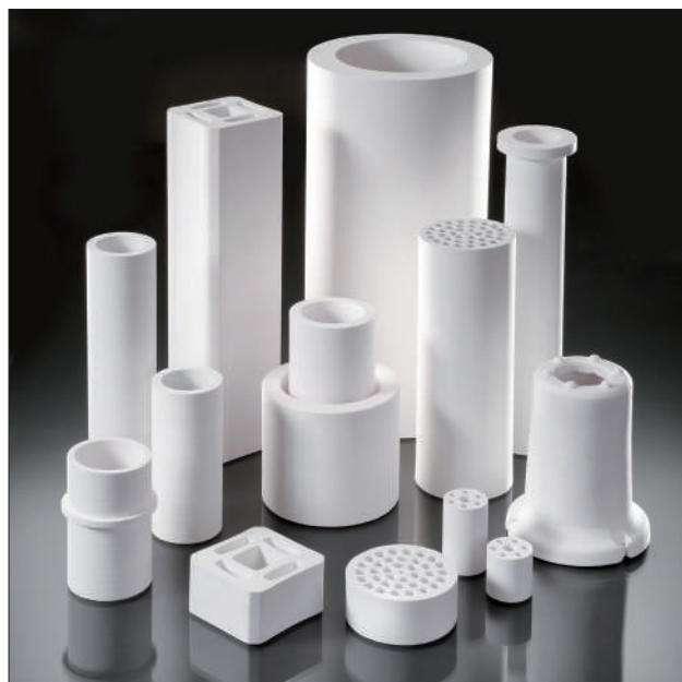
Fig. 1 Examples for RAMUL components

Alumina- and mullite-based materials for kiln furniture application of up to 1700 °C have been successfully developed. The materials show significantly improved thermomechanical properties in comparison to commercial benchmark products permitting the design of kiln furniture with reduced mass. This leads to significant energy savings in high temperature processes. It is demonstrated that the achieved improvement in corrosion resistance against lead-containing vapours increase the lifetime of the products considerably.