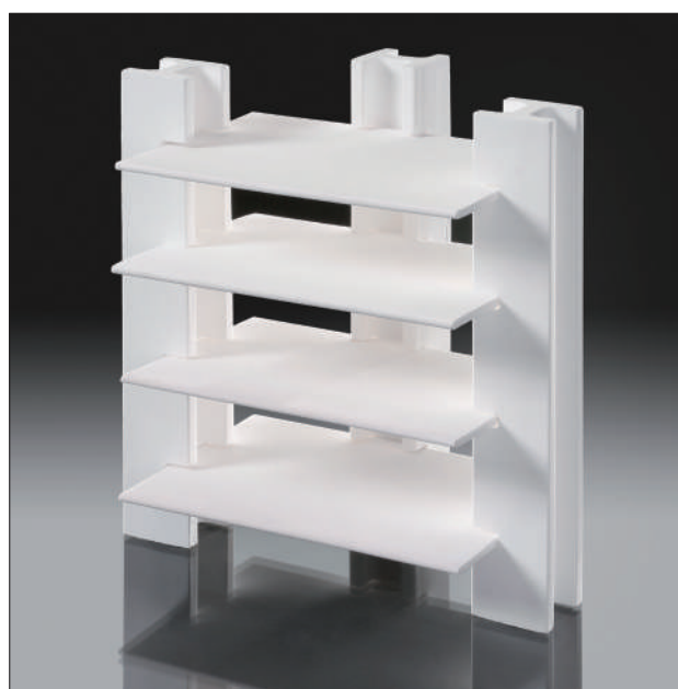
Fig. 8 RAKOR multi-platform racks for sintering smaller parts