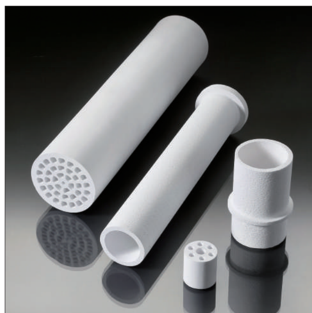
Fig. 7 Kiln components like exhaust collar pipes and firing props

Fig. 1 shows various examples of RAMUL and RAMUL-HT products like thin- and thick-walled pipes, square, round and multihole tubes and also collar pipes,