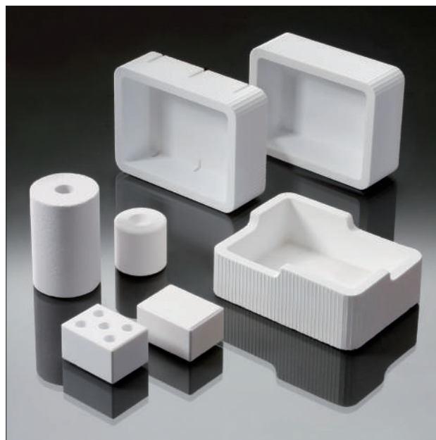
Fig. 2 RAKOR saggars and firing props